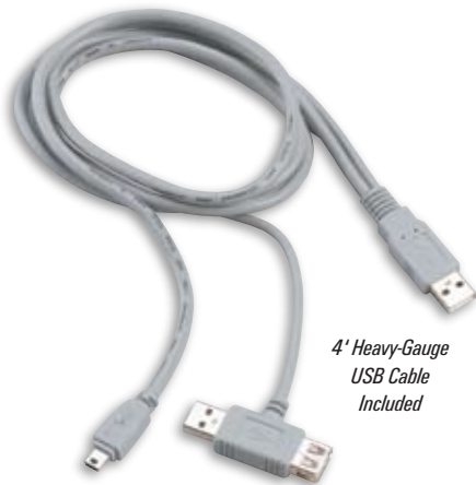
4' Heavy-Gauge USB Cable Included

Your MediaVault HD is easy to use and tailored to run on PCs, Macs or small networks. It's designed to be up and running in minutes, ready to be put to work with the click of a mouse. MediaVault HD enclosure and included external hard drives are backed by FireKing's three-year limited warranty.