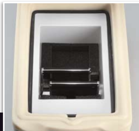
Model MVHD-500 - 500 GB Capacity