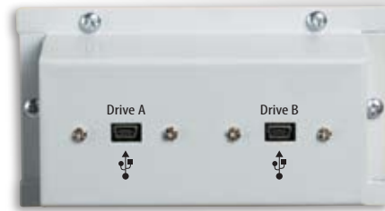
MVHD-500 with Dual Exterior Ports